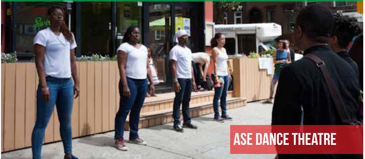
ASE DANCE THEATRE

“A balancing act has occurred between embracing change while still maintaining the energy and traditions of Bed-Stuy.”