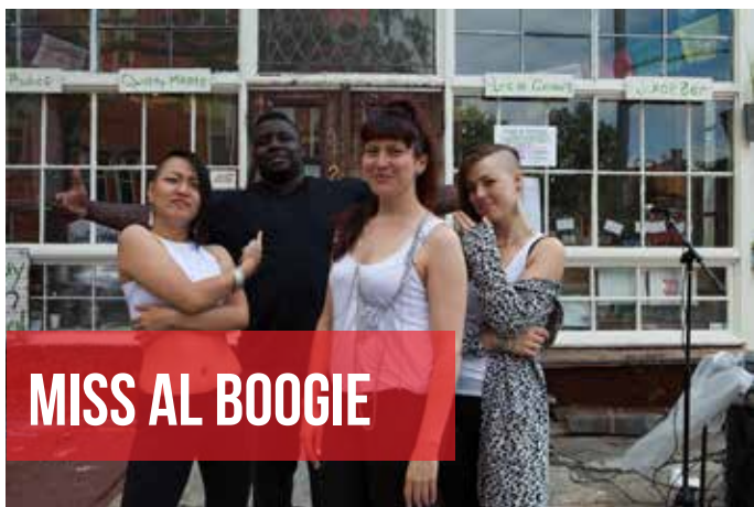
MISS AL BOOGIE